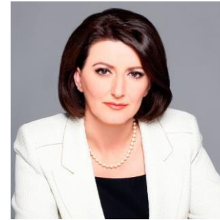
Atifete Jahjaga President of the Republic of Kosovo (2011-2016)