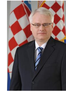
Prof. Dr. Ivo Josipović President of Croatia, 2010-2015 (invited)