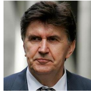
Dr. Ejup Ganić Chancellor of the SSST; Former President, Federation of Bosnia and Herzegovina