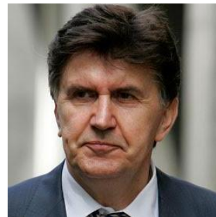
Dr. Ejup Ganić Chancellor of the SSST; Former President, Federation of Bosnia and Herzegovina