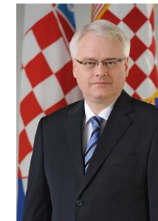
Prof. Dr. Ivo Josipović President of Croatia, 2010-2015 (invited)