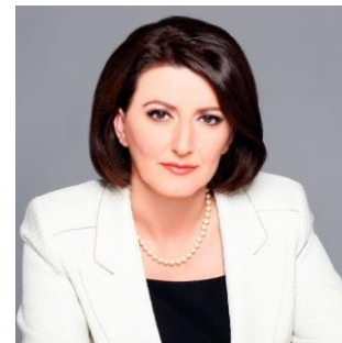
Atifete Jahjaga President of the Republic of Kosovo (2011-2016)