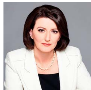
Atifete Jahjaga President of the Republic of Kosovo (2011-2016)