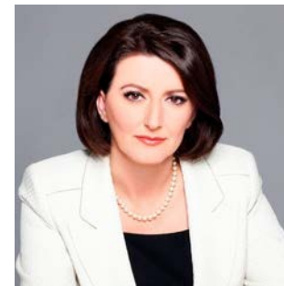
Atifete Jahjaga President of the Republic of Kosovo (2011-2016)