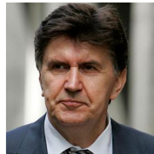
Dr. Ejup Ganić Chancellor of the SSST; Former President, Federation of Bosnia and Herzegovina